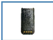
BIS Approved Li-ion 7.4V/2300 mAh